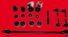
Suspension Kits for Holden & Ford