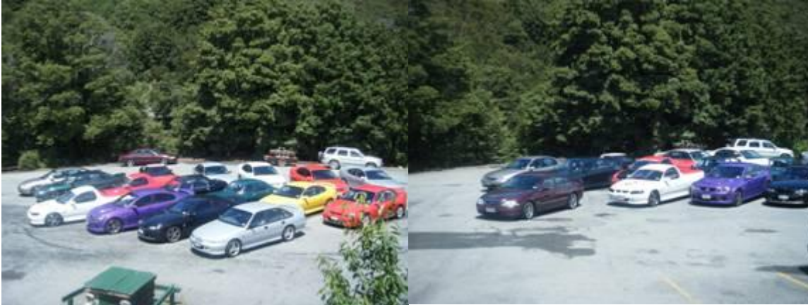
What is that strange one in the front? (At least it made it without a trailer)