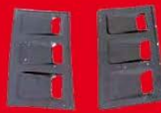
Rubber Control Arm Bushes for Holden